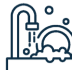
Hot water tap