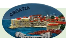
Magnet of your city or country